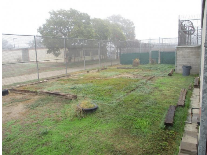
Photo: A section of the yard at KCJC.

Additionally, youth with disabilities are inevitably harmed by any unnecessary detention or re-detention for probation violations. Harsh enforcement and inadequate community-based service options means that youth with mental and behavioral health needs are found in violation of probation more often than their non-disabled peers. Putting youth, who are already traumatized and at risk of self-harm into repeated detention situations where they are also subject to discipline for disability related behavior (see below) is particularly harmful to this vulnerable population.