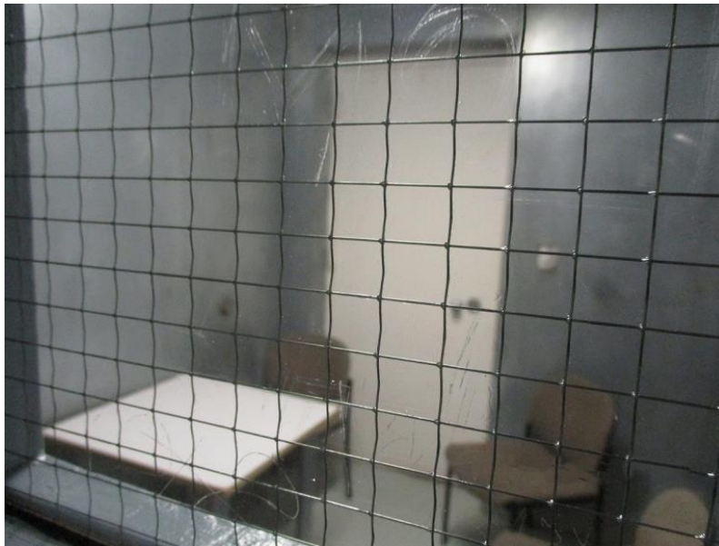
Photo: An interview room at KCJC as seen through the closed door.