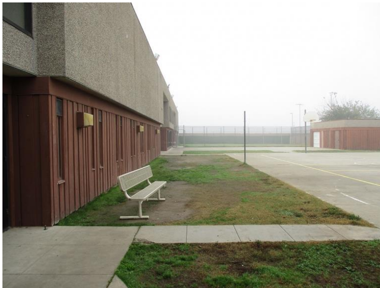
Photo: The exterior of the detention center.

Second, the youth detention center is prison-like and regimented, rather than the homelike, rehabilitative environment that state law requires. Youth are routinely pepper sprayed in their cells, day rooms and classrooms, often in their face and eyes. For minor infractions, youth are shackled and “body-slammed” by custody officers or forced to sit alone in hallways for hours at a time. Young people with mental health and behavioral disabilities are disproportionately subject to these practices, which lead to serial discipline, court reports and extensions of their length of stay. Organized activities and outdoor exercise are limited, so youth endure forced idleness, or at best, hours of watching TV in the dayrooms. The incentive program is frustrating and confusing, especially for disabled youth. These conditions re-traumatize many youth with a history of trauma held at the facility.