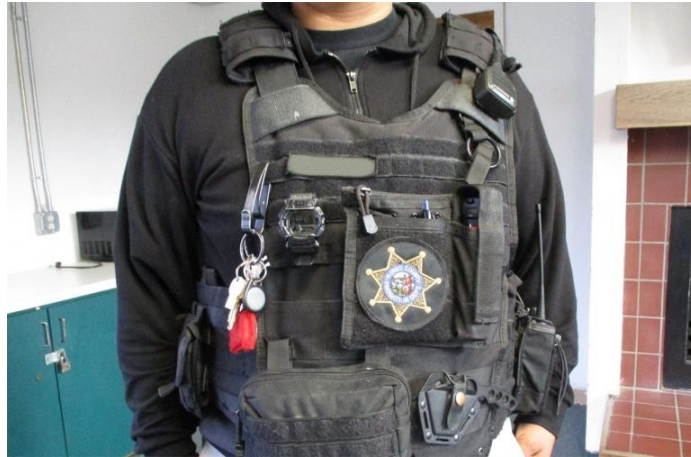
Photo: Probation staff wear tactical vests.

facilities, Probation, mental health and school staff have no regular process to review incident reports, discuss the needs of various youth, and coordinate supports to disabled youth.